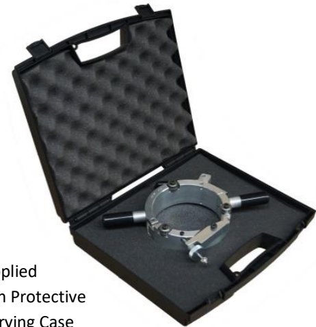
Supplied with Protective Carrying Case